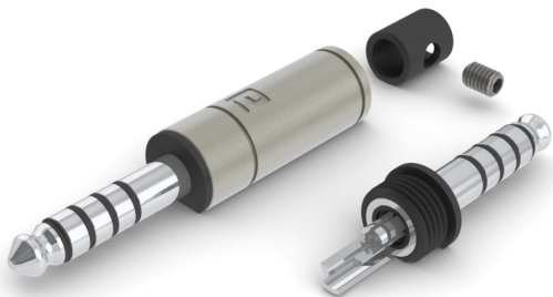
aeeco TRS AT4-1812S