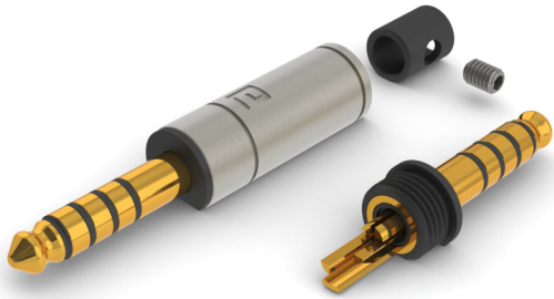
aeeco TRS AT4-1812G

POM sleeve is fixed with end of shell by using screw.