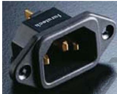
AC Inlet(R) Rhodium Plated FTECH-65010