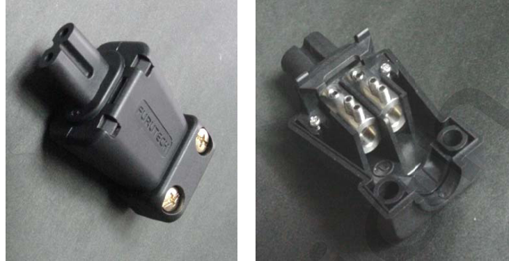
FTECH-73609 FI-8N (R) Set Screw Type