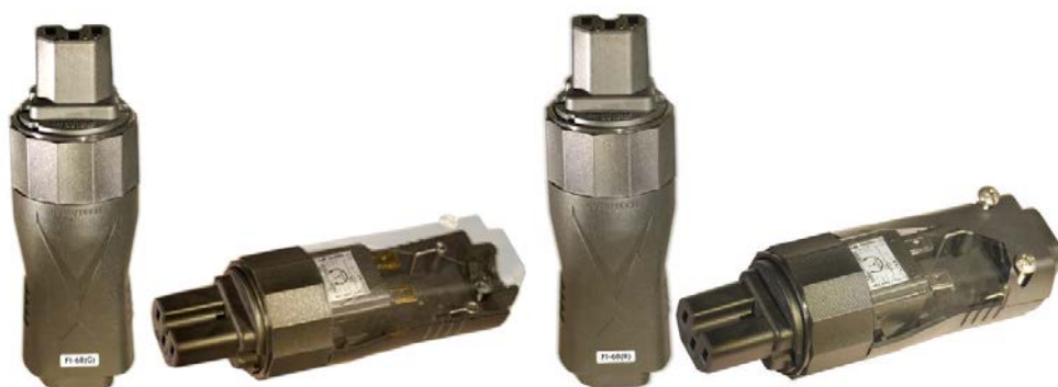
The Furutech FI-68 series Filter IEC connector