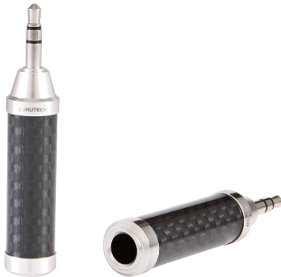
CF35(R) Adaptor 6.3 stereo to 3.5 stereo