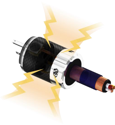
Without Floating Field Damper