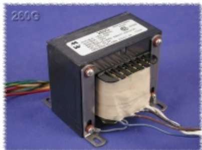
Plate & Filament 260 Series Universal Primary & 50/60 Hz. Operation