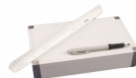
Protective covering on aluminum is perfect as