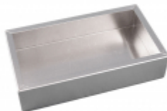
Standard version shown inside and out.