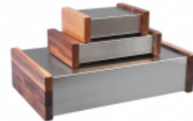
Six sizes available with walnut sides.