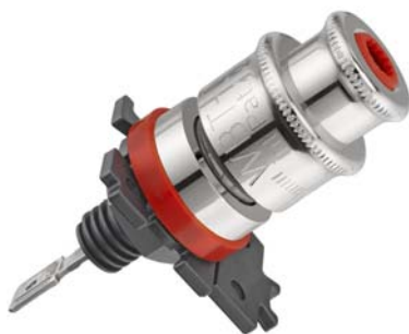
WBT- 0705 Ag RoHS compliant